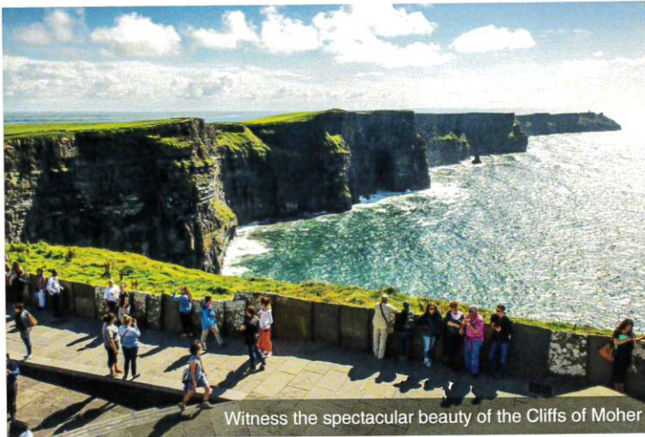
Witness the spectacular beauty of the Cliffs of Moher