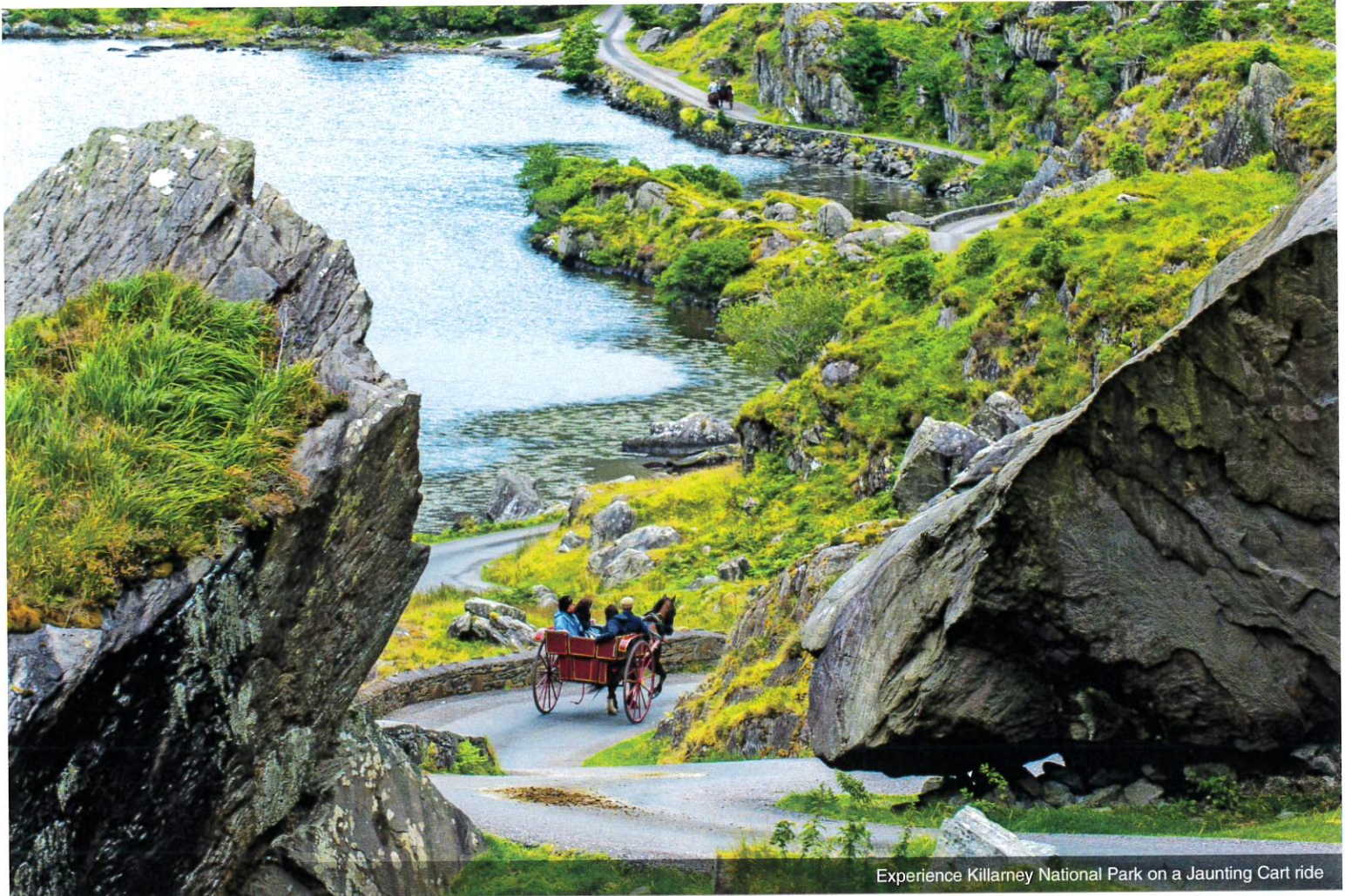
Experience Killarney National Park on a Jaunting Cart ride